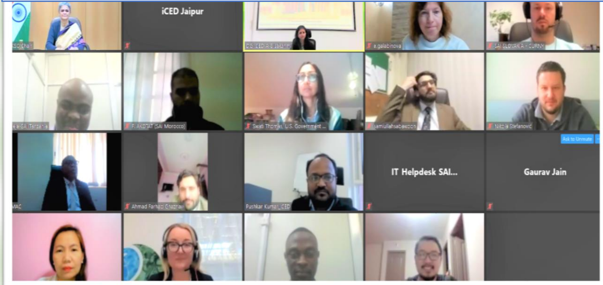
Participants of 8 th ITP on Environmental Auditing, organized online (7 th to 11 th December, 2020)